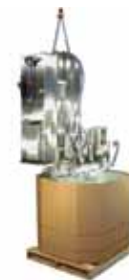
Bulk Bin Suspended