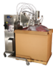
Bulk Bin Rolleraround